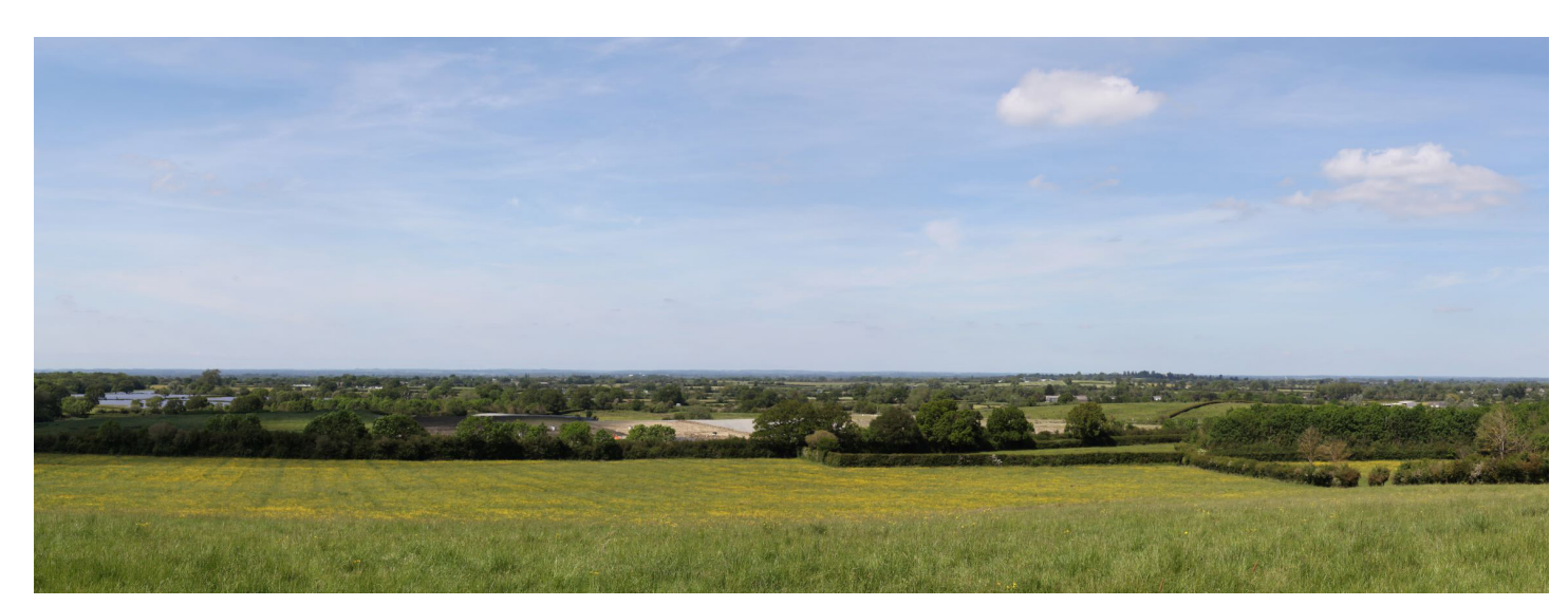
VP2 View north from Paven Hill.