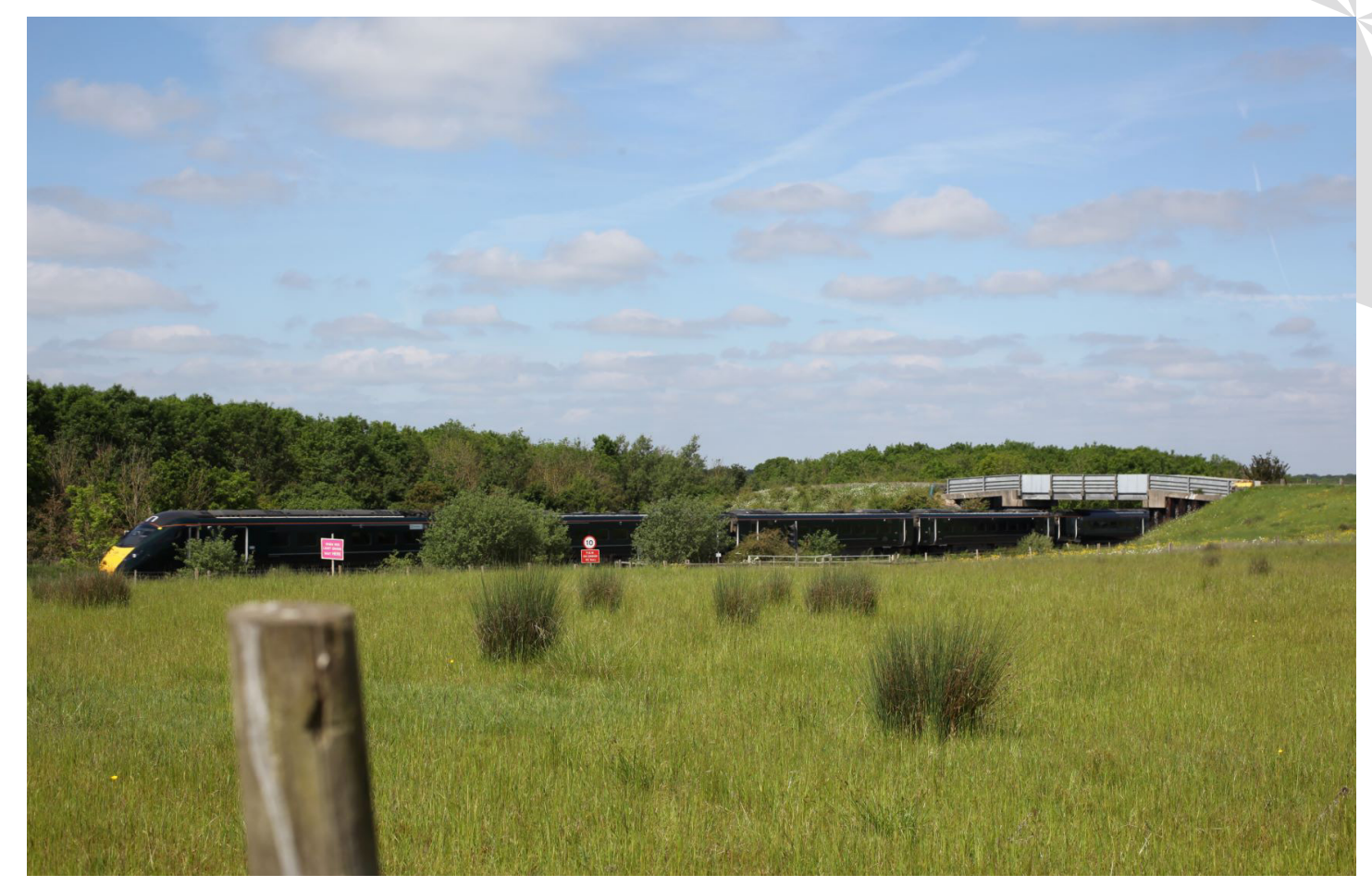
VP1 View west towards the mainline Stroud to Swindon railway.