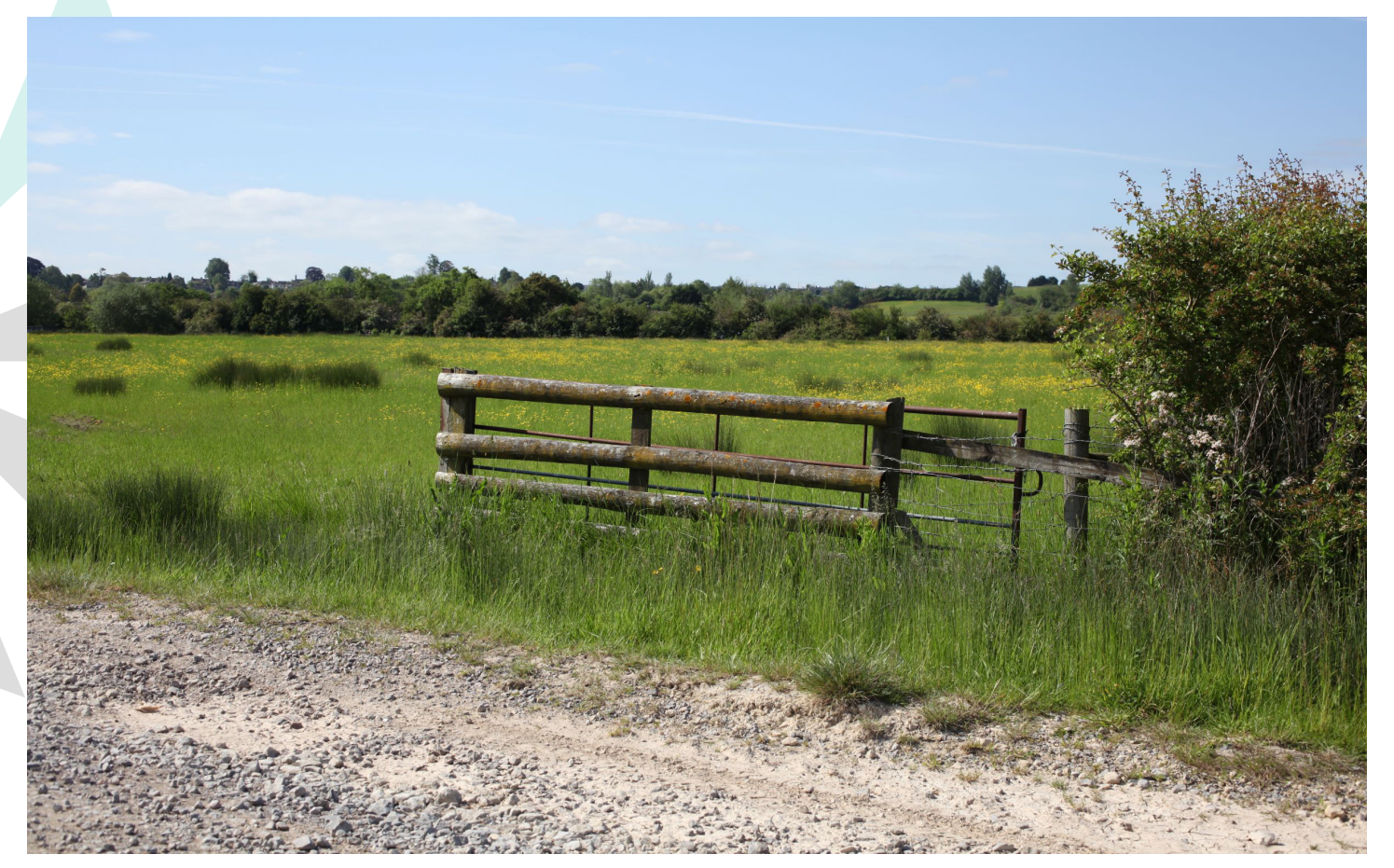
VP3 View south towards Purton