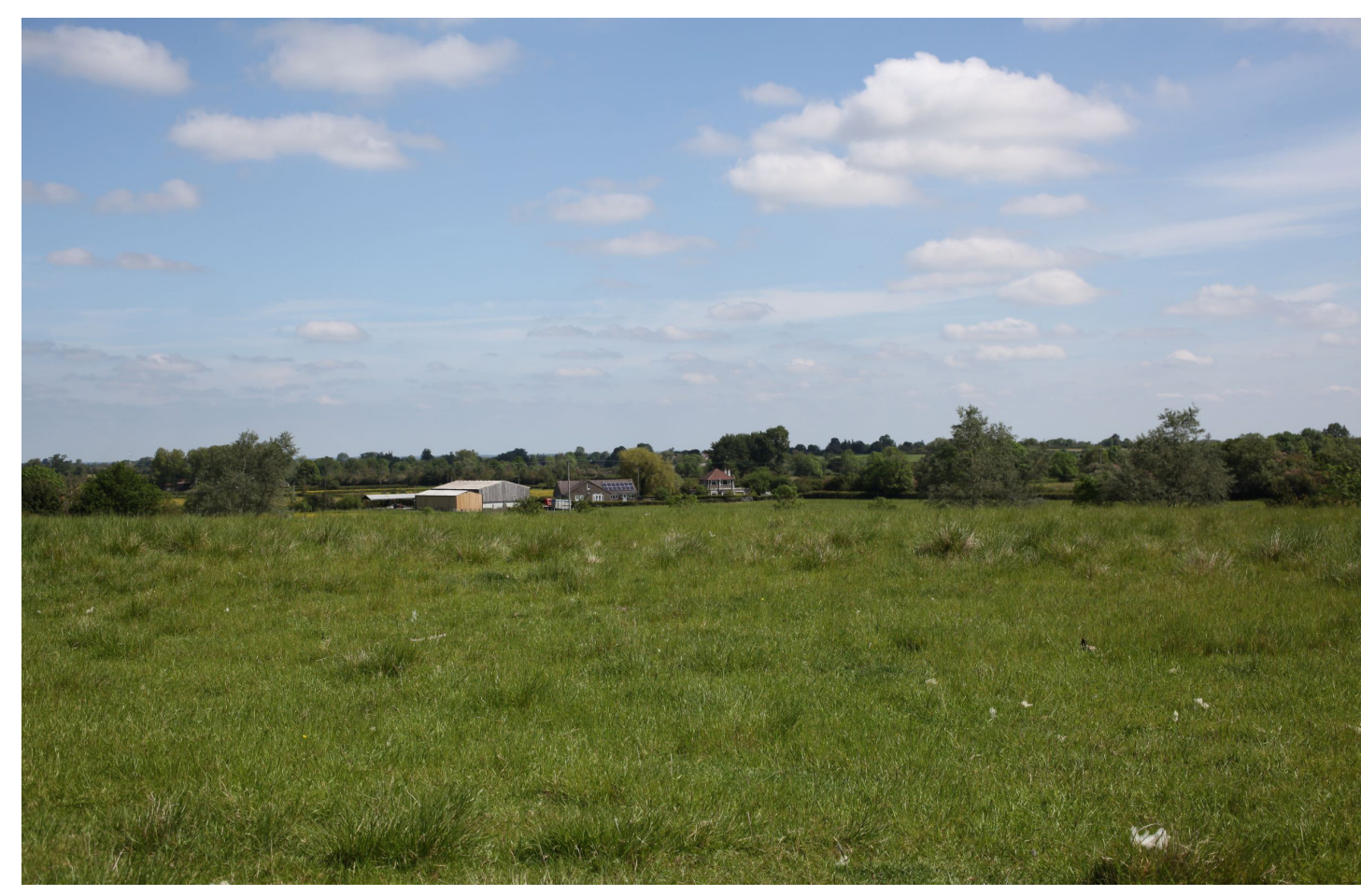
VP4 View north towards Bentham Lane.